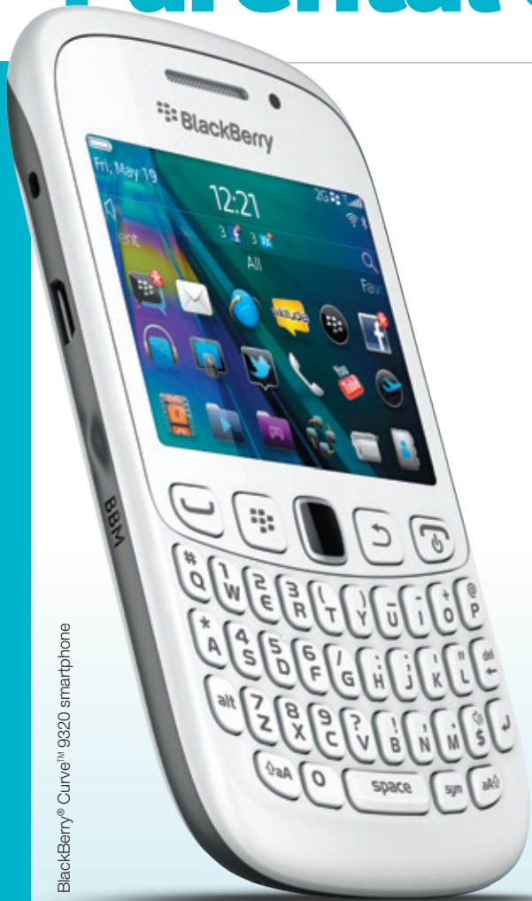
BlackBerry® Curve™ 9320 smartphone

Parental Controls are designed to help you have more control over how the features of the BlackBerry® smartphone are used.